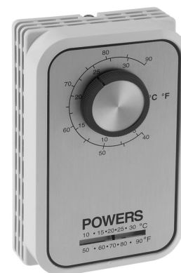
134 Electric Line Voltage Room Thermostat—Heating/Cooling.