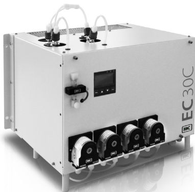
EC-30C with four SR25.2 peristaltic pumps